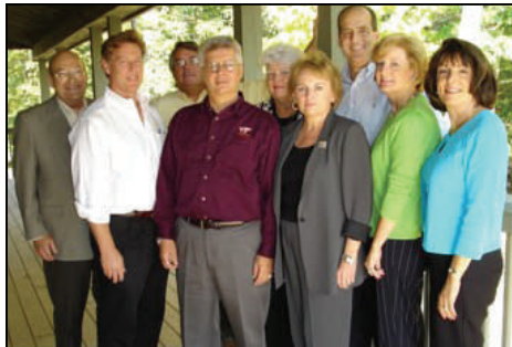
RPM Advisory Board members

The Residential Property Management Advisory Board is a key element in the success of the program. They offer curriculum input, guest lecturers in class, field trip and internship sites, and significant financial resources. Advisory Board members are on campus at least twice a year, interacting with faculty and students. They also provide financial support for field trips, professional development, mentoring and scholarship.